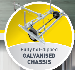
Fully hot-dipped GALVANISED CHASSIS