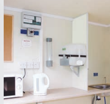
Well equipped canteen