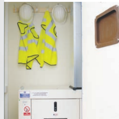
Warm room / Generator area