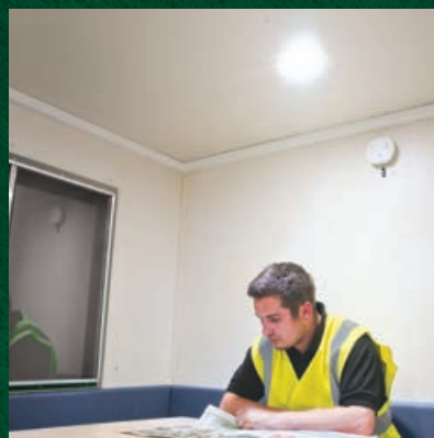
BATTERY POWERED LED LIGHTING

Featuring BATTERY POWERED LED lighting & USB sockets