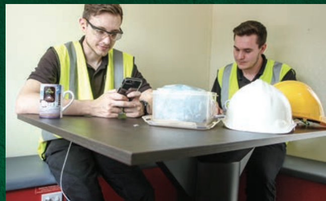
BATTERY POWERED USB SOCKET