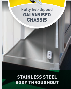
STAINLESS STEEL BODY THROUGHOUT